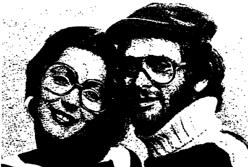
With its men's and women's high-fashion spectacle frames, Optima Company of Kibbutz Mishmarot claims that "fellows do indeed make passes at lassos who wear glasses."